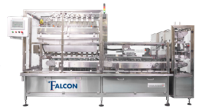
Falcon Net Weight Liquid Filler

- Falcon Net Weight Liquid Filler: Engineered for high-accuracy filling of challenging and abrasive liquids, the Falcon ensures precision for a wide range of viscosities and complex formulations, making it perfect for the demanding needs of North American and Western European manufacturers.