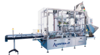
Alantra P – Servo-Based Capping System

- The ALANTRA P is a versatile, all-in-one capping solution designed to handle diverse cap types with precision and efficiency. Tailored for industries like cosmetics, chemicals, and food, it combines flexibility, quick changeovers, and user-friendly controls, making it an ideal choice for modern production lines.