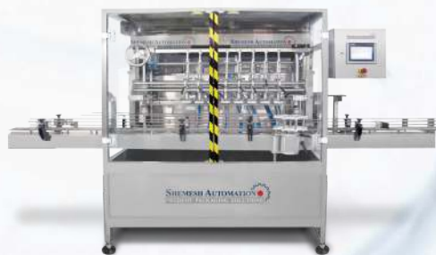
FGW120 Inline Liquid Filler and Doser