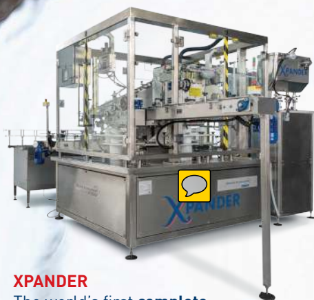
XPANDER The world's first complete , all-in-one round wipes packer