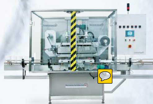
SEALPRO120 Inline Cut Foiler and Sealer

Market leader Shemesh Automation Wet Wipes is the world's only manufacturer to offer both complete inline and monoblock round wipes packaging solutions to meet any requirement. From single units to full turnkey applications, Shemesh is the name you can rely on for innovation that keeps you ahead of the competition.