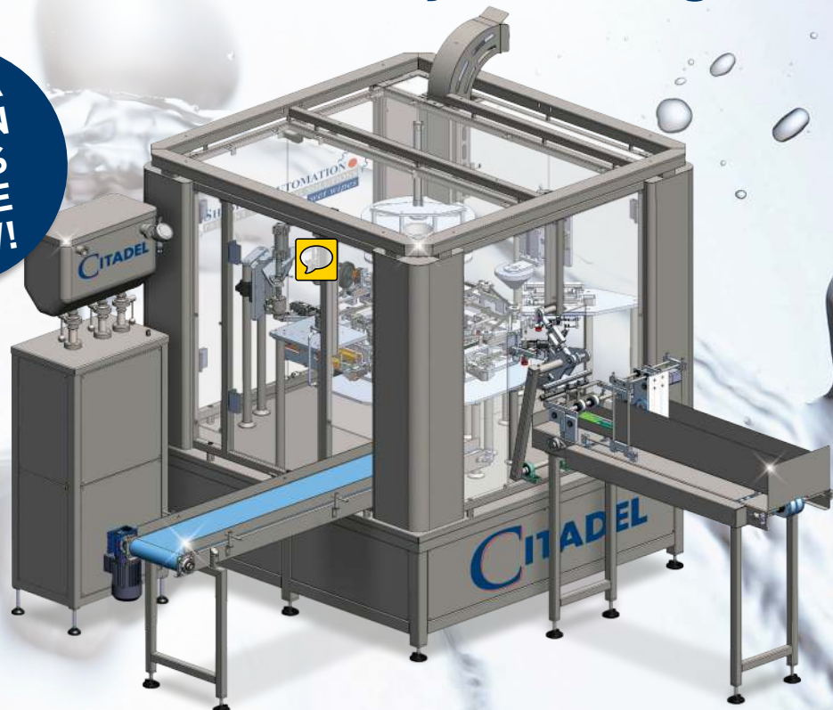
CITADEL World's first complete monoblock solution for wipes packaging in ready made bags. Fully automated bag feed, form, roll stuffing, liquid filling & bag sealing – all in one block with full QC!