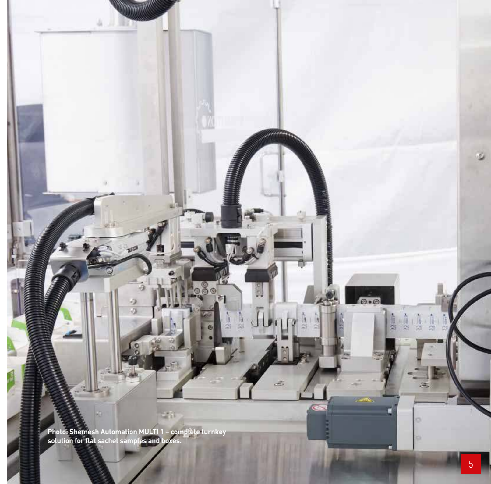
MULTI 1 – complete turnkey solution for flat sachet samples and boxes.