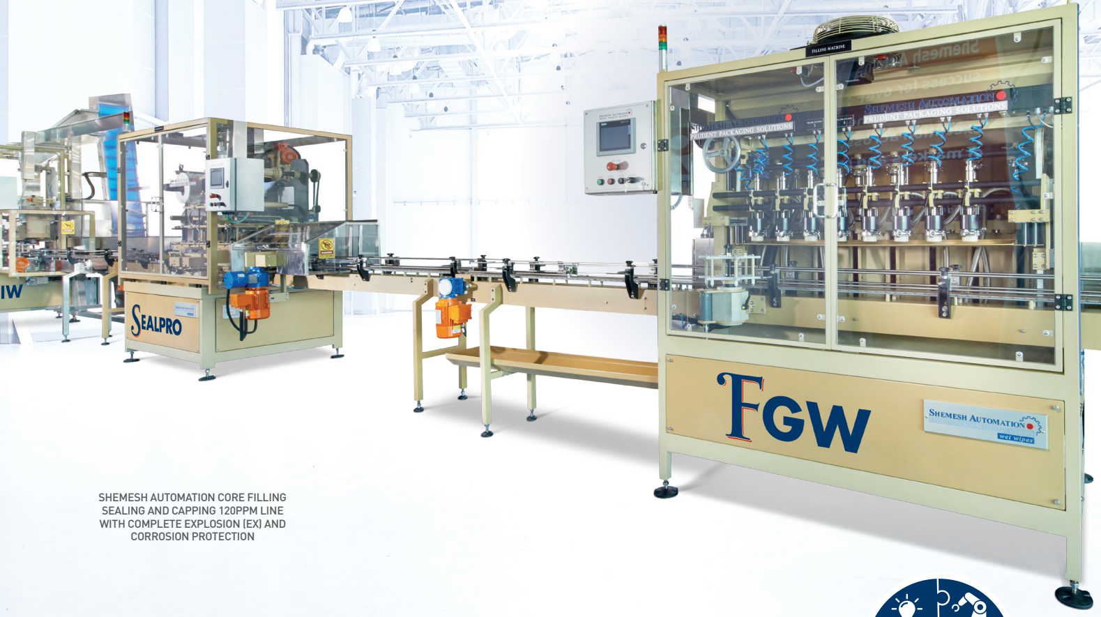
SHEMESH AUTOMATION CORE FILLING SEALING AND CAPPING 120PPM LINE WITH COMPLETE EXPLOSION (EX) AND CORROSION PROTECTION